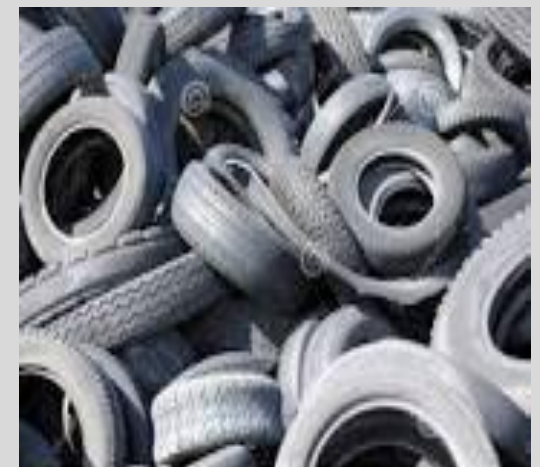
April 5-15, 2019

Please place tires beside the street separate from regular garbage.